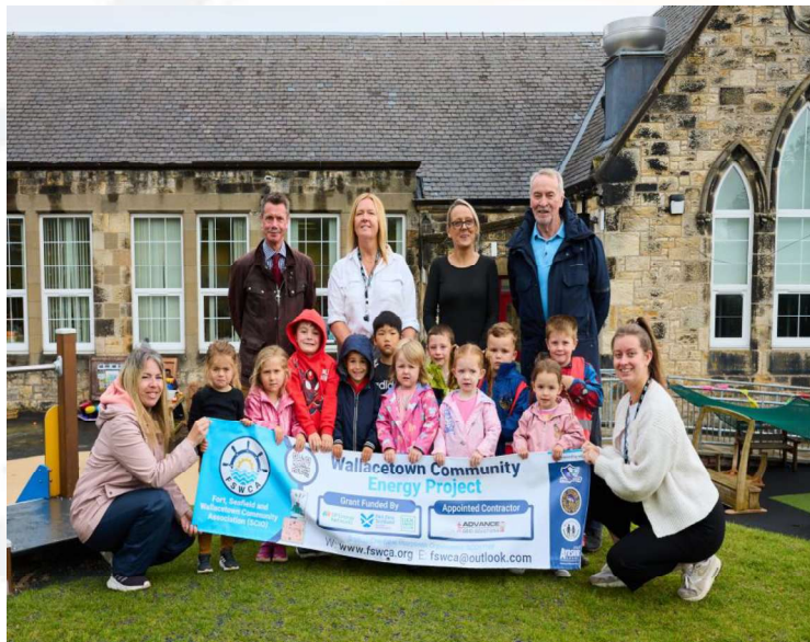
Wallacetown Early Year's Centre