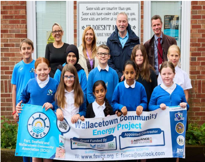
Newton Primary School