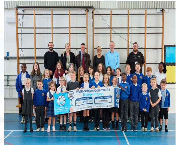
St John's Primary School