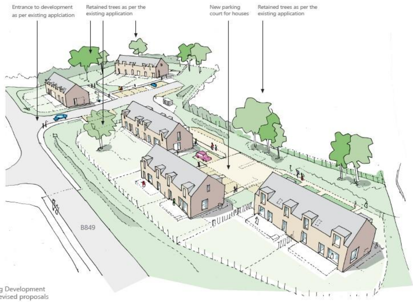
Lochaline Housing Development Aerial Sketch of revised proposals Feb '25